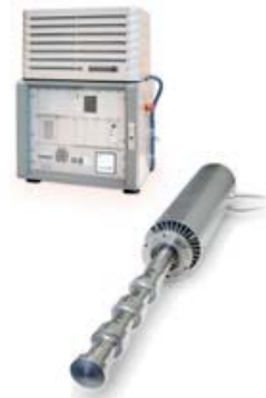
ultrasonic industry processors