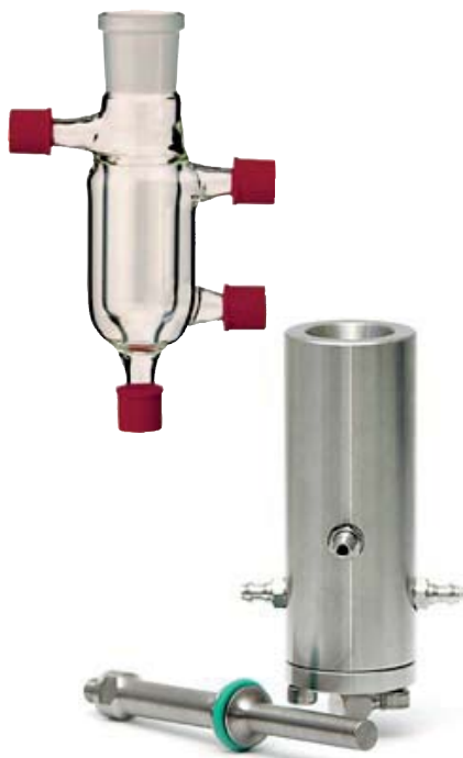
flow cells GD7K and D7K

The ultrasonic processor UP100H (100 watts, 30kHz) has the same dimensions as the UP50H but it is suited for the double power output. With the use of the 10mm sonotrode the field of applications expands to applications with volumes of up to 500ml.