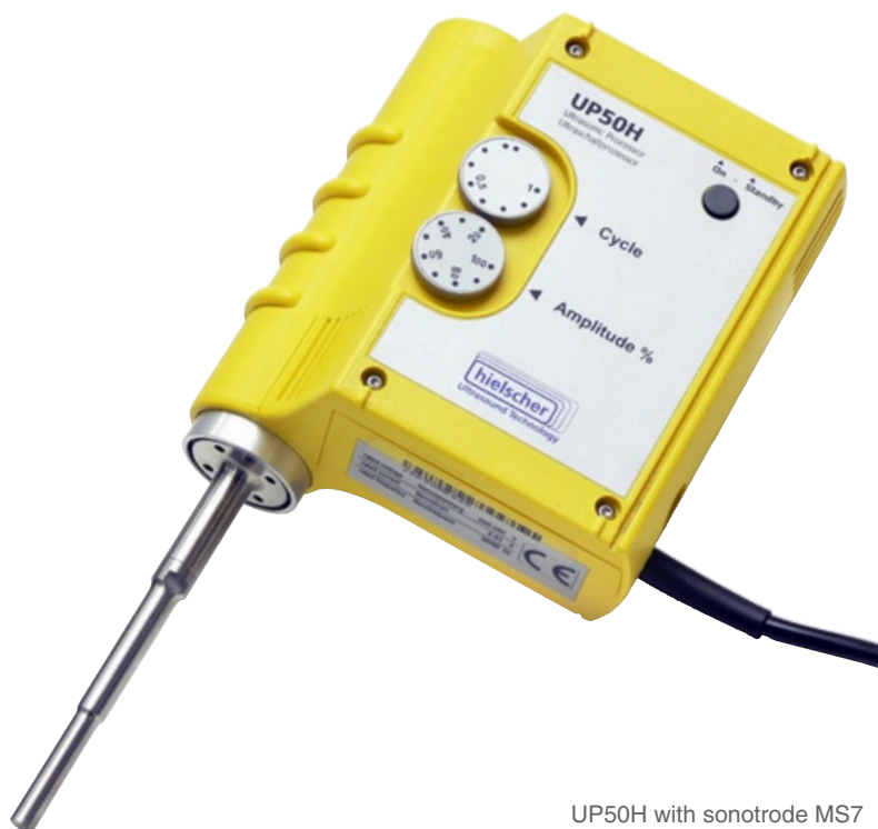
UP50H with sonotrode MS7

The ultrasonic processor UP50H (50 watts, 30kHz) is the smallest model of our aesthetic laboratory devices, that are only supplied by Hielscher Ultrasonics in that compact form.