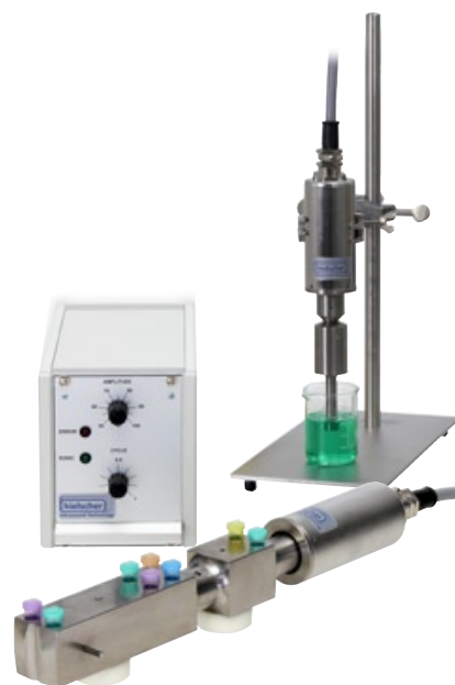
VialTweeter (front) and sonotrode (back) at ultrasonic processor UIS250v

The VialTweeter can be cleaned and disinfected easily. The VialTweeter is autoclavable and the transducer of the UIS250v is made of stainless steel (IP65, NEMA4). The generator is connected to the transducer by a 4m connection cable. Alternatively to the VialTweeter, the UIS250v can be equipped with sonotrodes for direct immersion into liquids. In that way, the UIS250v can be used as a hand-held or stand-mounted homogenizer.