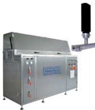
wire-, tape- and profile cleaning