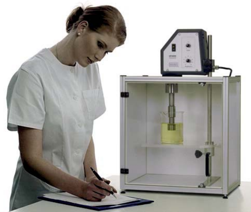
UP400S with H22 in sound protection box

The ultrasonic processor UP400S (400 watts, 24kHz) is our most powerful laboratory device. With sonotrodes of a diameter range from 3 to 40mm the device is suited for sample volumes from 5 to 4000ml. In flow approx. 10 to 50 liters per hour can be treated. For the preparation of test portions the UP400S is mainly used for bigger volumes. It is suited for the practical process development in the laboratory but also in the college of technology as well as for the production of small quantities. For production quantities a PC-control or a connecting lead to a central control of the user's plant is recommended in order to raise the process safety. With special flow cells and flange connections liquids can also be sonicated at high temperatures and pressures.