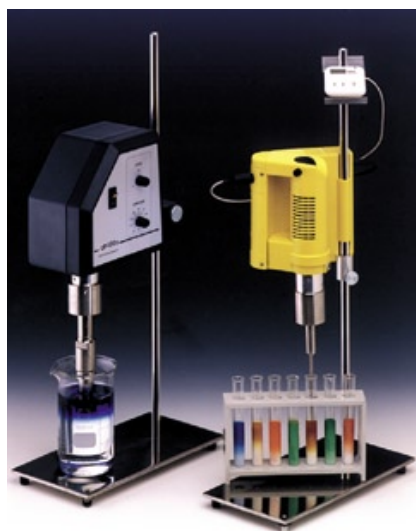
UP400S and UP200H with timer

As desk-space in the laboratory is expensive we supply ultrasonic processors in a compact design: Power supply, generator, control and transducer, all of which are located in an aesthetic housing. No additional cables impede.