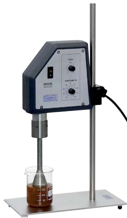
UP200S with S40

As all our laboratory devices the UP200S finds its customers worldwide. Without any additional fees we supply our devices for local power supplies from 100 to 240V and with the corresponding plugs.