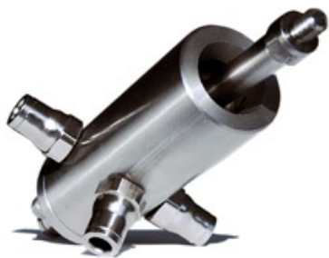
stainless steel flow cell D7K with MS7D