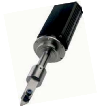
cutting and welding