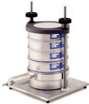
ultrasonic sieving in the laboratory