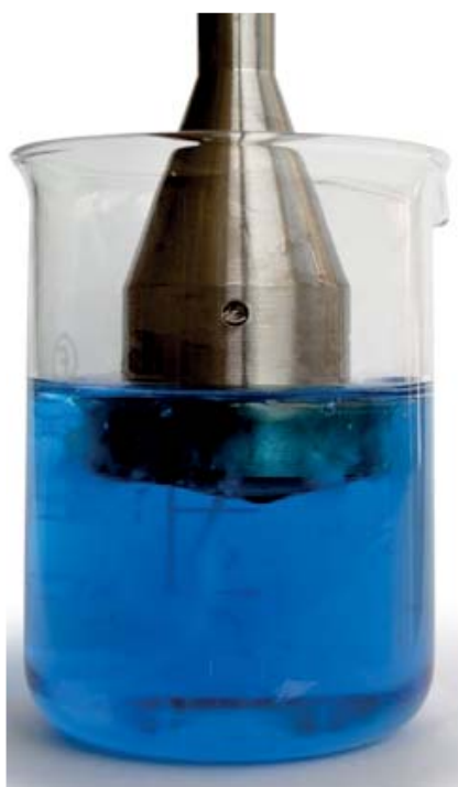
cavitation at S40

The ultrasonic processor UP200S (200 watts, 24kHz) differs from the UP200H only with its shape and its use only with stand.