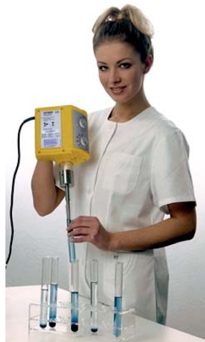
UP200H with S7

We offer a comprehensive range of accessories for the UP200H such as flow cells, stand, sound protection box, timer and PC-control.