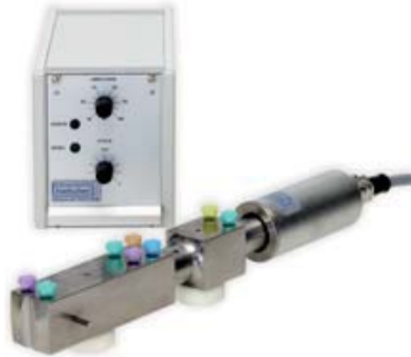
sonication of closed vials