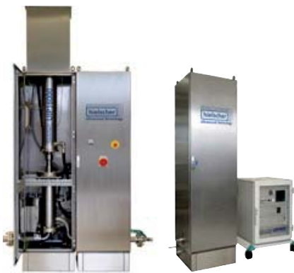
ultrasonic dispersing systems