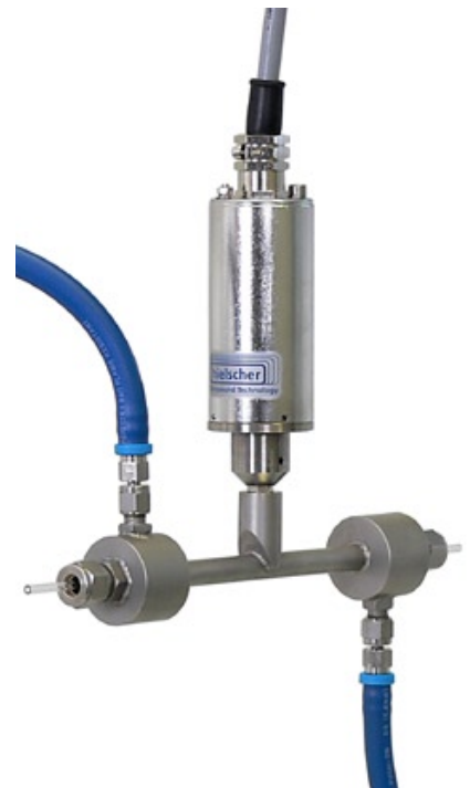
contamination free flow cell Dmini

For our ultrasonic processors we offer flow cells made of glass or stainless steel. The liquid to be sonicated is led in from below and passes through the cavitation zone under the sonotrode. The appropriate sonotrodes are equipped with O-rings, that are fitted closely to the cell wall or the PTFE-adapter. For higher pressures and temperatures the sonotrodes may be equipped with metallic oscillating-free flanges that are mounted to the stainless steel flow cells. The selected flow rate corresponds to the energy input required. The temperature of the medium can be influenced by means of a cooling jacket. Special designs of the flow cell, e.g. several supply connectors when emulsifying, are manufactured according to the demands of the customer. A new product in our product range is the mini flow cell (patent pending). When using this mini cell, the medium is hermetically sealed, so that the sonication can be realized without contamination.