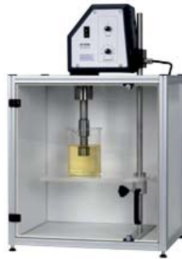
ultrasonic laboratory processors