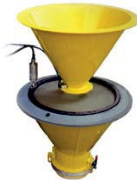
industrial ultrasonic sieving